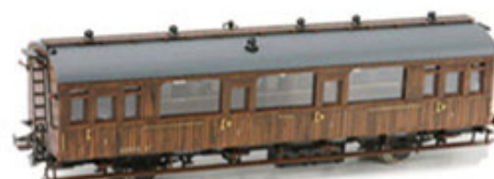
REF. 81601-3° 81602-2° 81603-3°