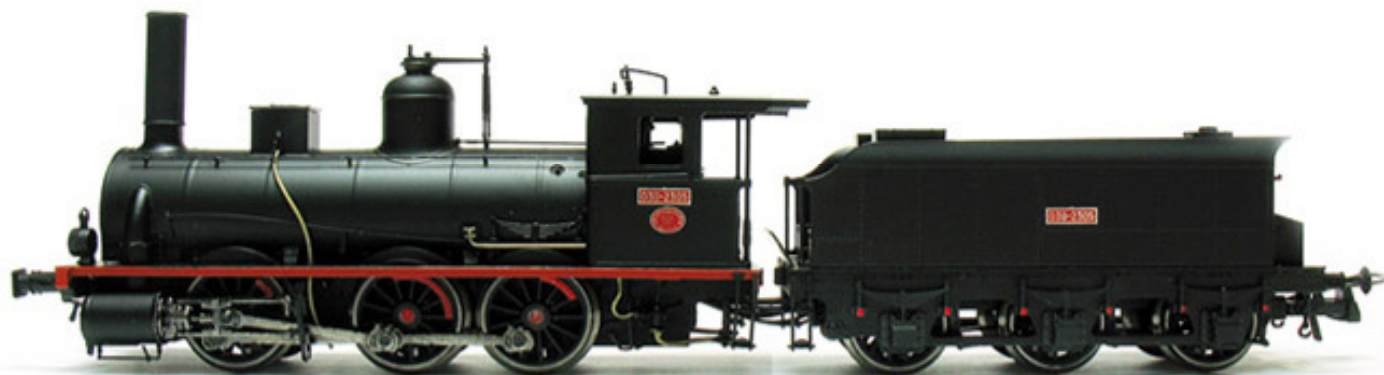
REF. 82201 N° 030-2305