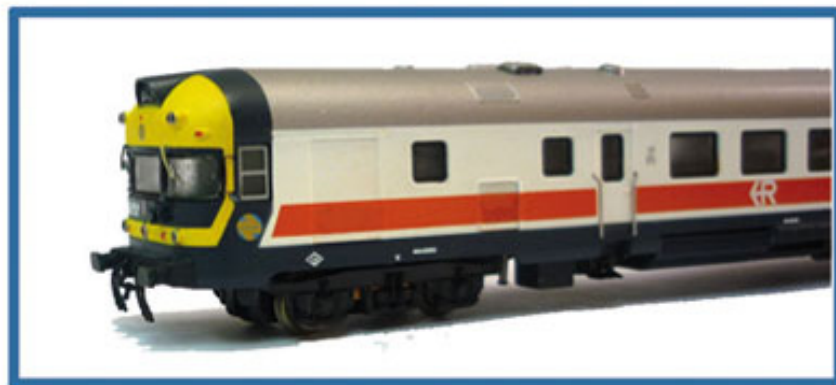
REF. 89713 TER 597-017 DC REF. 89713S TER 597-017 DCC LOKSOUND