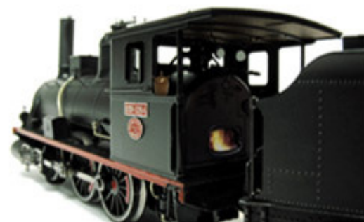
REF.82200 N° 030-2264