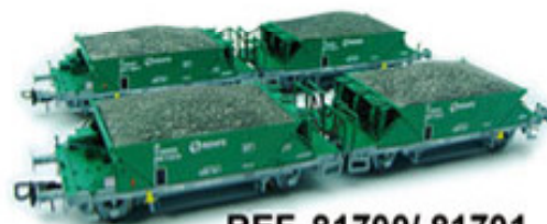
REF. 81700/ 81701