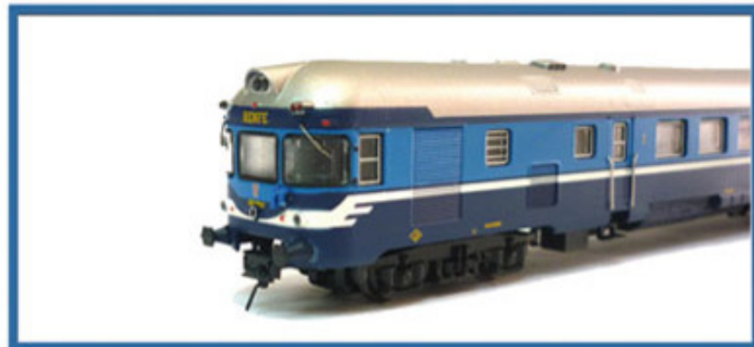
REF. 89718 TER 597-005 DC REF. 89718S TER 597-005 DCC LOKSOUND