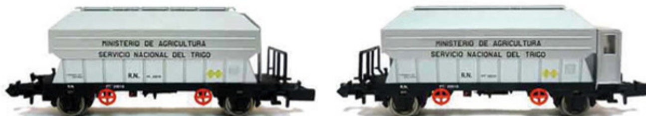
"SERVICIO NACIONAL DEL TRIGO" (WHEAT)

Ref. 25002/A set 2 hopper wagons without brake cabin, numerations 20006 and 20007.