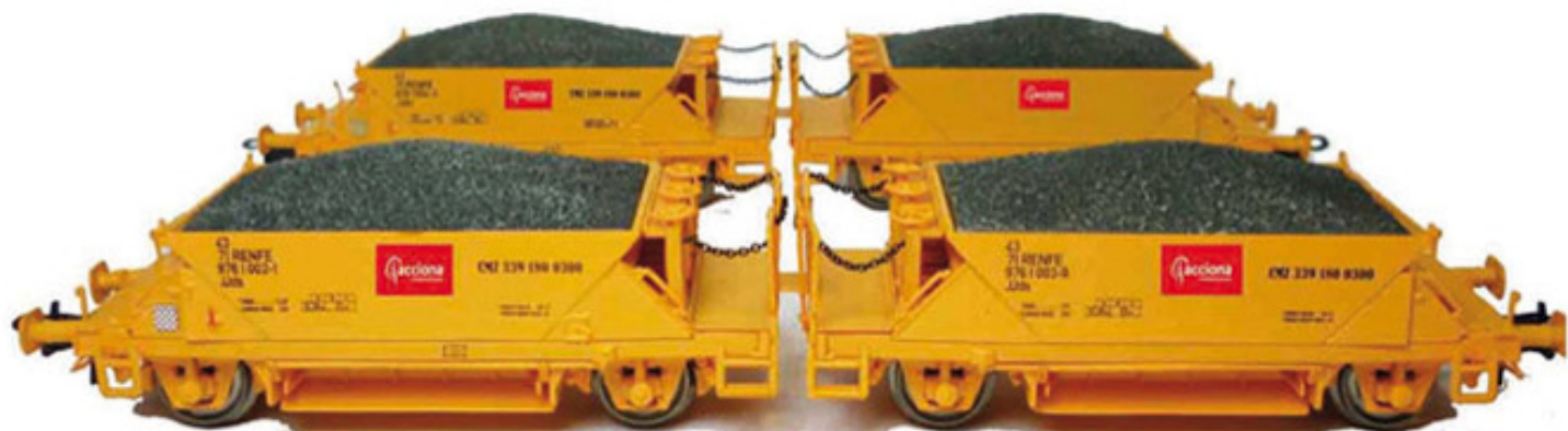
REF. 81711 RENFE-ACCIONA