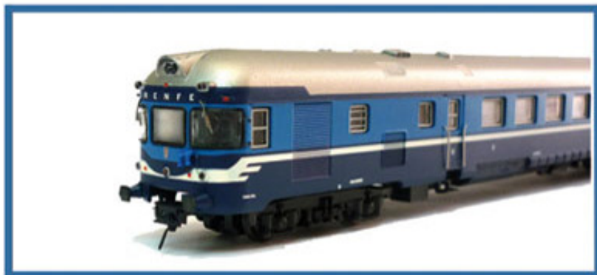
REF. 89717 TER 597-057 DC REF. 89717S TER 597-057 DCC LOKSOUND