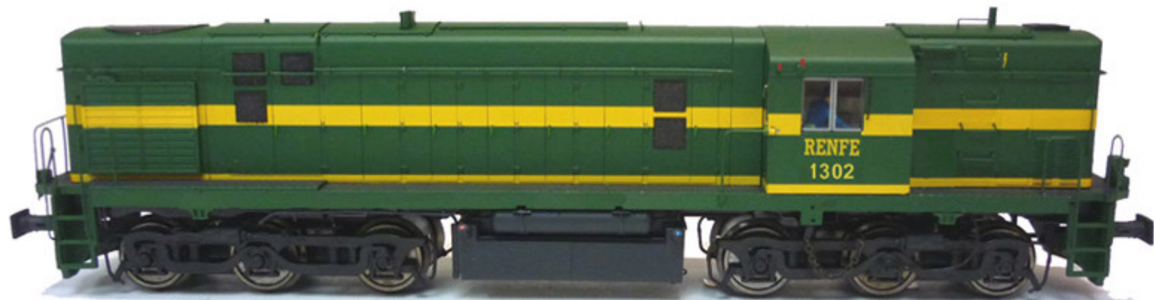
REF. 81308 DIESEL ALCO 1302 DC