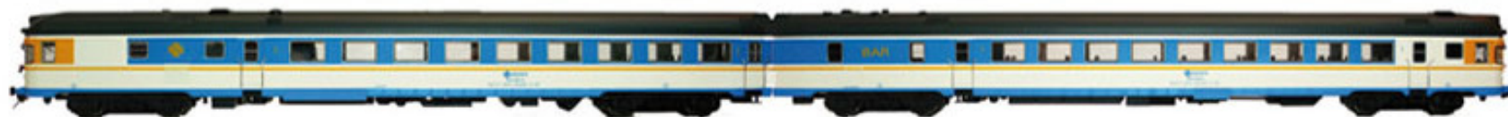
REF. 85977 N° 9718 DC REF. 85978 N° 9752 DC