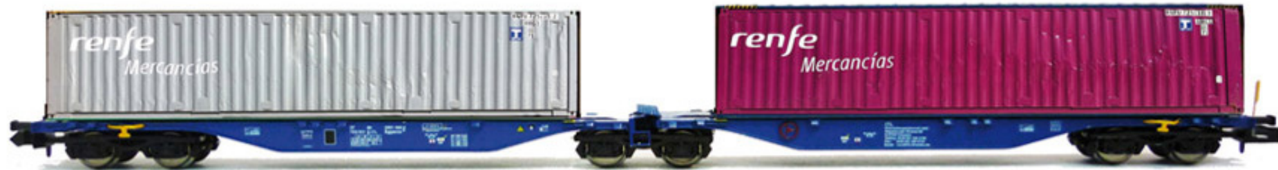
REF. 60200 Manufactured by Rocky Rail, exclusively for MABAR / Fabricado por Rocky Rail, en exclusiva para MABAR