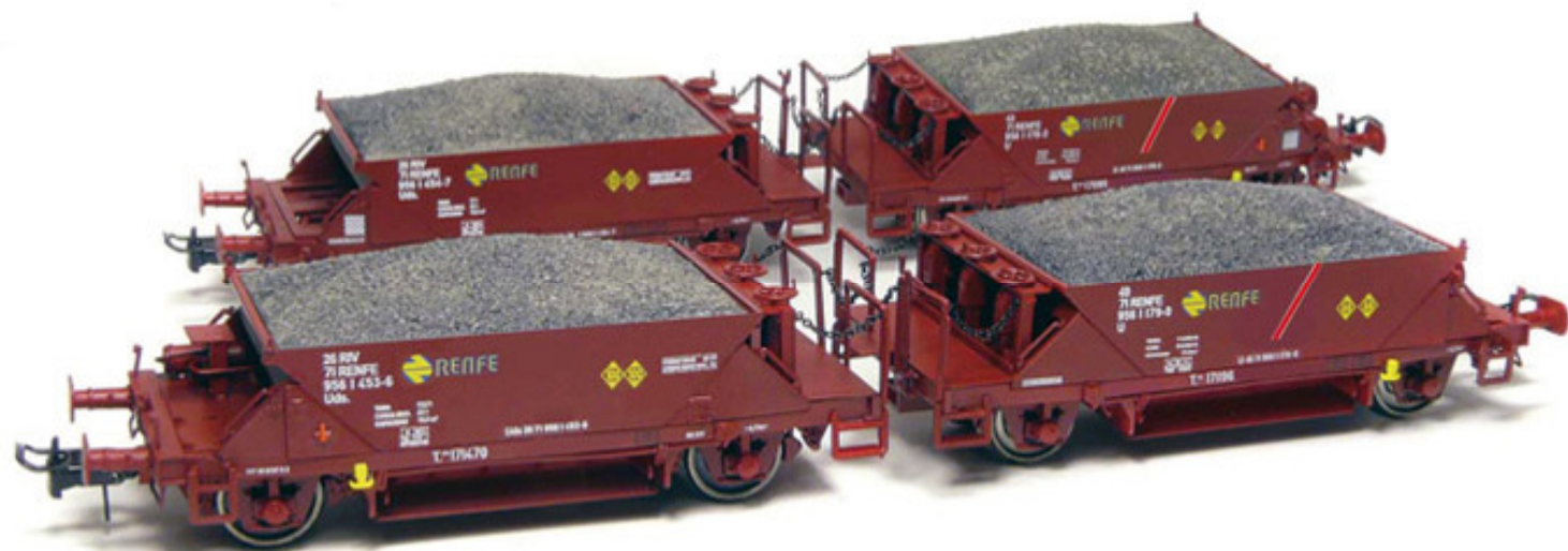
REF. 81714 RENFE