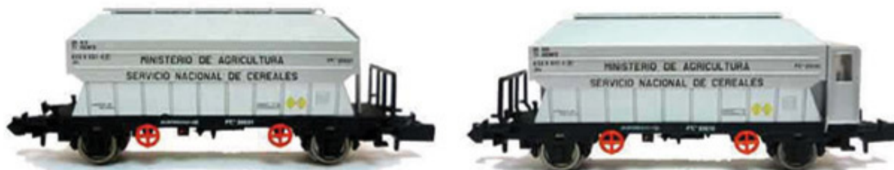
"SERVICIO NACIONAL DE CEREALES" (CEREAL)

Ref. 25002 /C set 2 tolvas con UIC, matrícula 20001 con garita y 20003 sin garita y sin manivela freno.