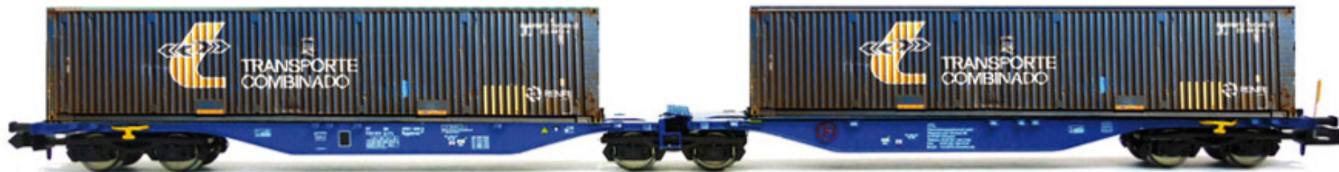
REF. 60201 Manufactured by Rocky Rail, exclusively for MABAR / fabricado por Rocky Rail, en exclusiva para MABAR