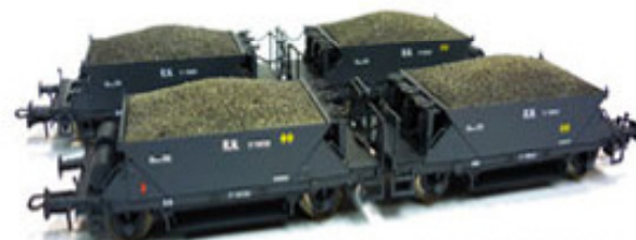
REF. 81710 RENFE